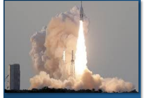
Our software developers on NASA's Commercial Crew Program modeled thousands of vehicle malfunctions, using parameter bias, automated triggers, and additional advanced methods to give trainers a variety of anomalous scenarios a spacecraft may experience in flight. These specialized software models provide a robust way to train the crew for operational flight conditions.