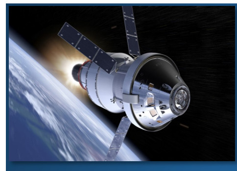
We are on Agile scrum teams developing GN&C, communications, propulsion, and life support systems software for NASA's Orion spacecraft. We provide software systems engineering, development, integration, and test for flight, ground, and simulation software at labs in Houston and Denver and lead the architecture and development of Orion's real-time simulation system.